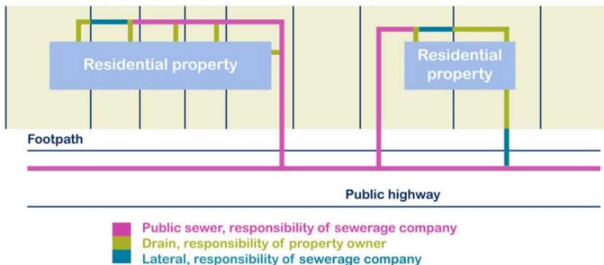
Figure 2 – Sewer and drainpipe ownership